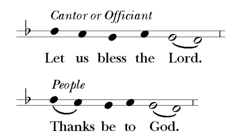
All sing the Hymn in Procession (next page)

Hymn in Procession 572* Weary of all trumpeting