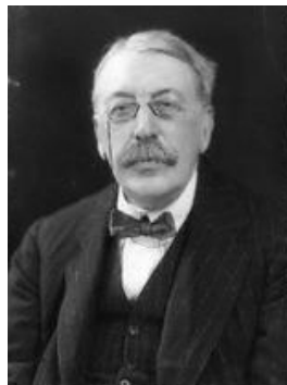
Charles Villiers Stanford (1852-1924)

Mendelssohn's Six Sonatas for Organ appeared in print in London, Leipzig, Milan, and Paris in September 1845. Following a most noble processional march, Mendelssohn weaves the sombre tune of Martin Luther's great chorale Aus tiefer Not (a paraphrase of Psalm 130: From deepest woe I cry to thee ) into the inner fugal sections of the first movement of Sonata 3. The march returns triumphantly in response. The ensuing movement bespeaks a quiet calm with Mendelssohn's trademark luscious harmonies.