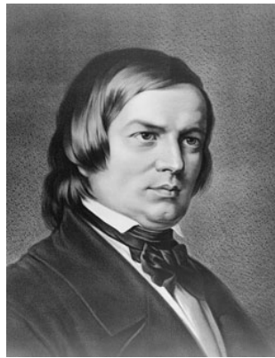
Robert Schumann (1810-1856)

Like so many eccentric artists, German composer Robert Schumann spent much of his life questioning his own sanity. Indeed his life was filled with melodrama. The emotional high points were periods in which he was most compositionally productive, and the times of depression saw very little flowing from his compositional pen.