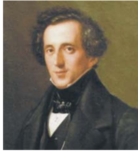
Felix Mendelssohn (1804-1847)

A common thread through today's program is a connection by each of these composers to each other, and ultimately with Johann Sebastian Bach. Today we owe a great deal of credit of our knowledge of Bach to Felix Mendelssohn, who, in entertaining his own interest in Bach's work, organized and conducted a performance of St Matthew Passion , in March 1829, thus generating enthusiasm in Bach's music that has trickled down to our generation.